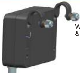
Wall mount hanger & nylon screw x 2

Wall mount hook to fix monitor and pH probe to water tank