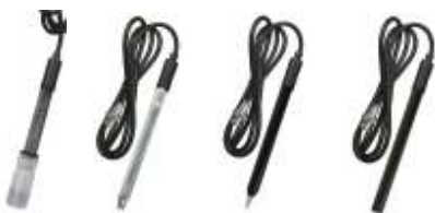
Low ionic 86P4